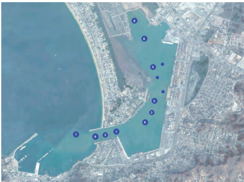
Gathering conductivity, temperature and depth data at multiple sites in Manzanillo harbor was easy with the one-pound CastAway-CTD. Results will guide the reconnection of the harbor with the freshwater lagoon to its north.

Almost immediately after each cast, the unit's built-in color LCD